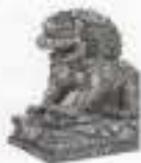
Dog of Foo